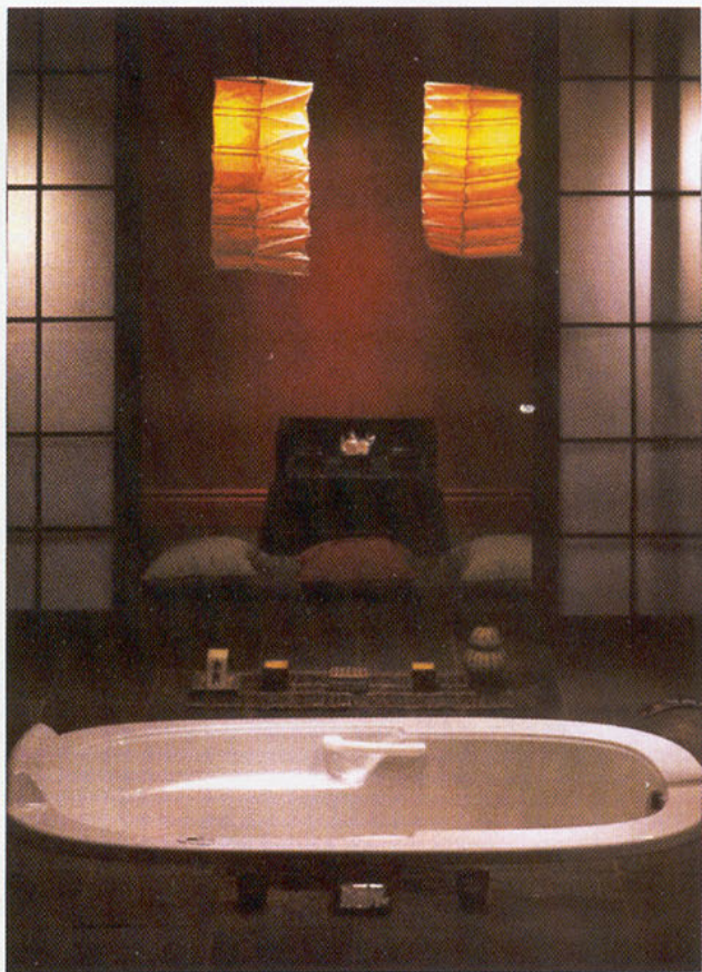
The various styles of Bain Ultra's air baths are as pleasant to a room's ambience as they are on sore muscles.